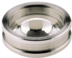
OCULAR 132D INDIRECT VITRECTOMY LENS (Product Code: OIV-132)