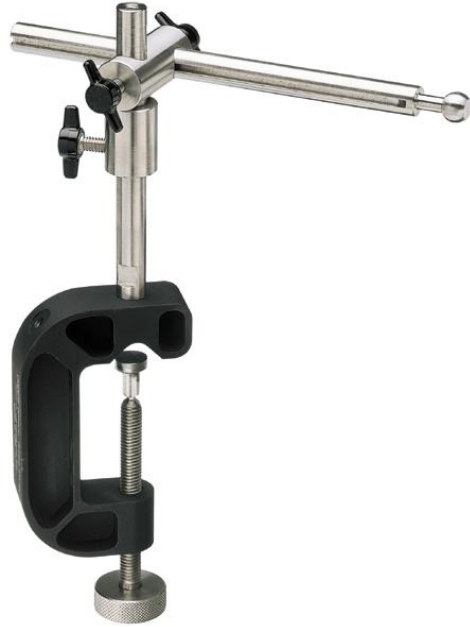
OCULAR LANDERS WIDE ANGLE SURGICAL VIEWING SYSTEM (Product Code: OSVS) Developed with: Maurice B. Landers, III, M.D., Chapel Hill, NC